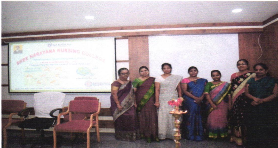
Fig 2: Faculty were starting the program with lamp lighting